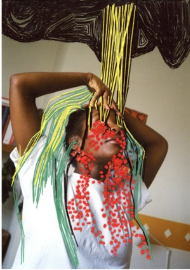
'All Stretched Out' for NOW Gallery by Nicole Chui

CONTACT US FOR ACCESS TO ALL HIGH RES IMAGES VIDEO AND DIGITAL ART CONTENT ALSO AVAILABLE