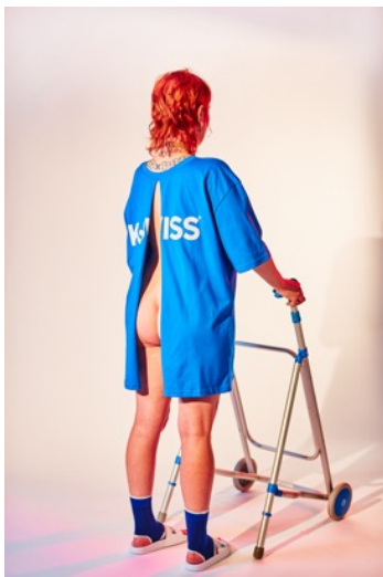
Able Zine x K Swiss

CONTACT US FOR ACCESS TO ALL HIGH RES IMAGES VIDEO AND DIGITAL ART CONTENT ALSO AVAILABLE